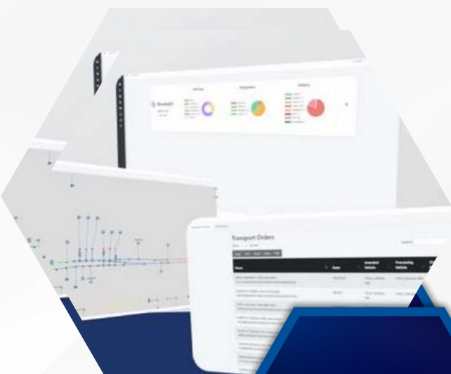
AI Based Fleet Management Software