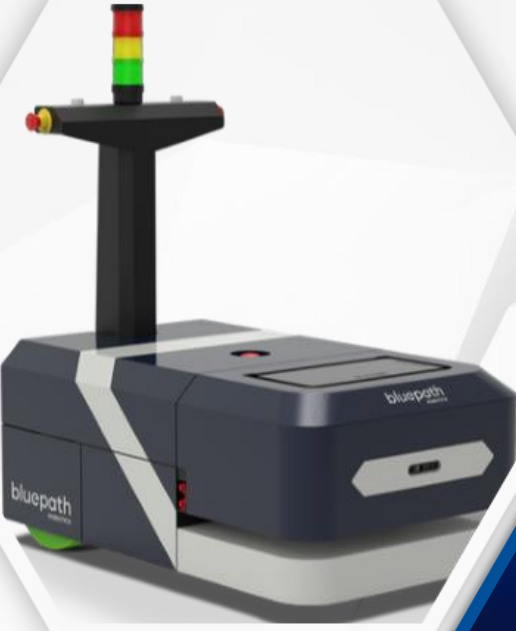
Autonomous Mobile Robots