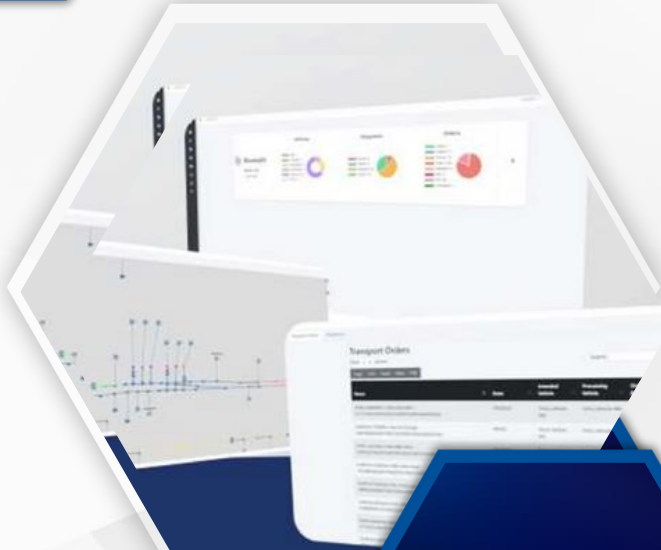
Fleet Management System